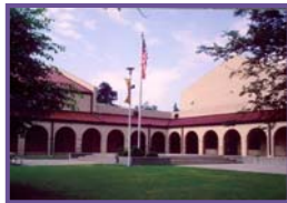
Franciscan Center Theater

Lights, Camera, Action ~ The Stage Is Yours! Like no other state pageant you have seen! Be part of a full theater production! Lourdes College Campus Picturesque Northwest Ohio City of Sylvania.