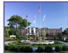
Wingate Inn & Suites

Lights, Camera, Action ~ The Stage Is Yours! Like no other state pageant you have seen! Be part of a full theater production! Lourdes College Campus Picturesque Northwest Ohio City of Sylvania.